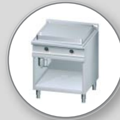
ELECTRIC GRIDDLE RANGES - STEEL PLATE WITH PLUG