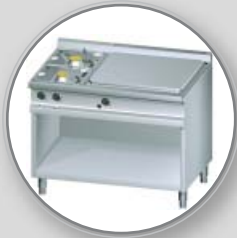
GAS SIMPLE SERVICE