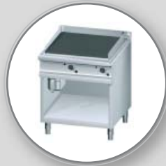
GAS GRILL TOP RANGES WITH STEEL PLATE