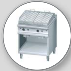
GAS CHARCOAL GRILL