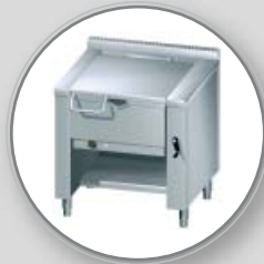
ELECTRIC TILTING BRATT - PAN