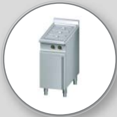
ELECTRIC BAINS - MARIE