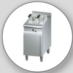
GAS DEEP FAT FRYERS