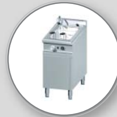
GAS PASTA - COOKER