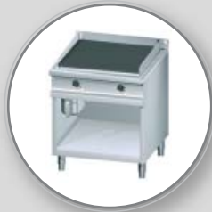
ELECTRIC GRILL TOP RANGES WITH STEEL PLATE