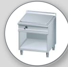
GAS SOLID TOP RANGES