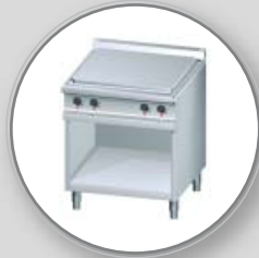
ELECTRIC SURFACE RANGES