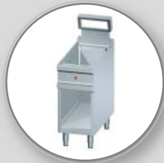
ELECTRIC CHIP SCUTTLE