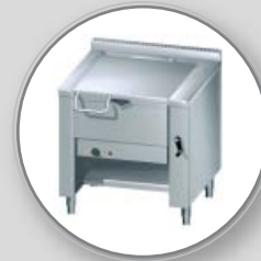
GAS TILTING BRATT - PAN