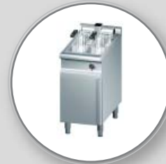
ELECTRIC DEEP FAT FRYERS WITH ELECTROMECHANICAL CONTROL