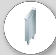
COMPENSATION ELEMENT - INSTALLATION ELEMENT