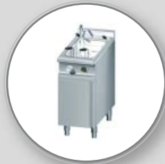
ELECTRIC PASTA - COOKER