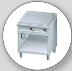
GAS GRILL TOP RANGES WITH COMPOUND PLATE