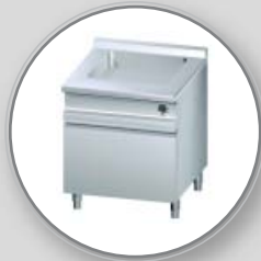
ELECTRIC MULTI-FUNCTION BRATT - PAN