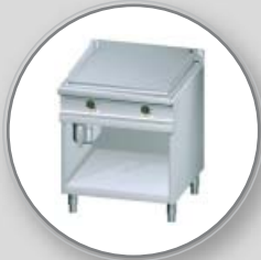
ELECTRIC GRILL TOP RANGES WITH COMPOUND PLATE